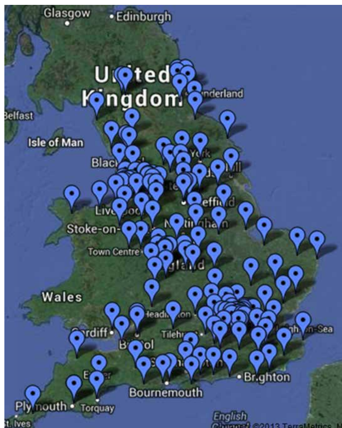
Map pins show the locations of the hospitals participating in ADDRESS-2 (a subset are participating in ADDRESS).